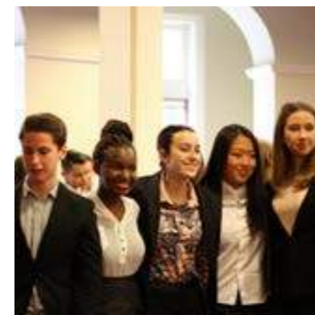
Delegates at UN Youth Australia's National Conference held in Perth in 2017.