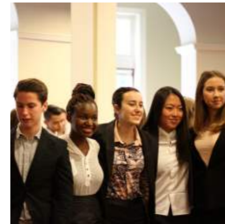
Delegates at UN Youth Australia's National Conference held in Perth in 2017.