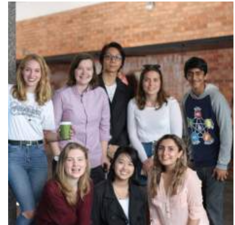
With some participants from UN Youth NSW's Gender Equality Summit held at the University of Parkes.