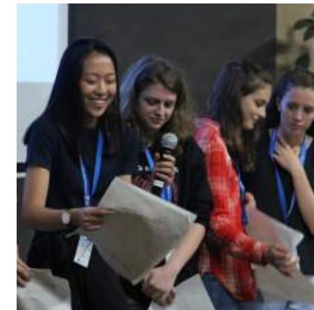
Students present their ideas for how they would change government policy during the consultation at Collaroy.