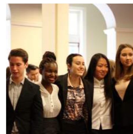
Delegates at UN Youth Australia's National Conference held in Perth in 2017.