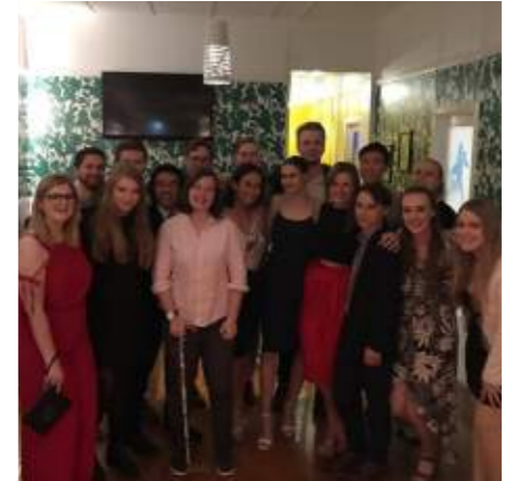
Team of UN Youth QLD facilitators who helped run the QLD consultations.