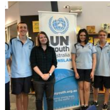
With some student leaders at the consultation at Marymount on the Gold Coast.