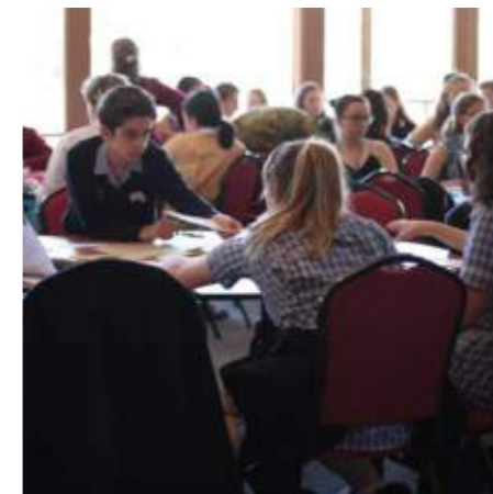
First consultation of the year, at Scotch College, Melbourne.